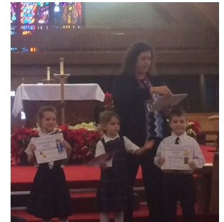
2nd Quarter Awards Ceremony